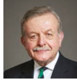
Lord Lexden Conservative peer